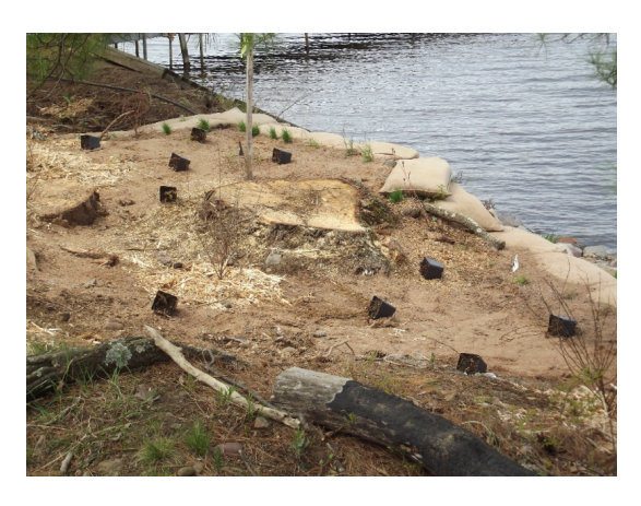
A portion of the upland buffer being planted in early June, 2017. In all, over 4,000 native shrubs and plants have been planted so far.

Cleanup, he said, began immediately and continues today, fixing cabins and making repairs. It was not just the shoreline that got a facelift but the cabins as well.