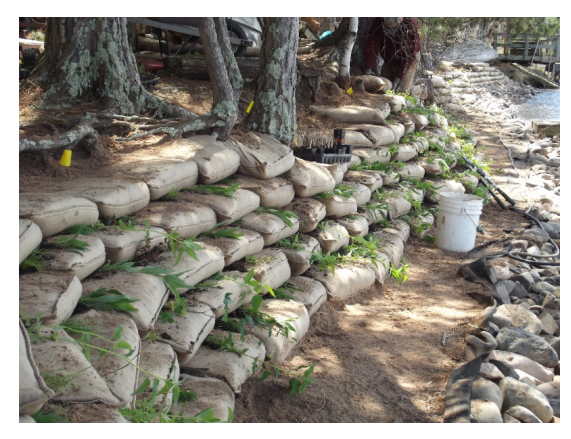
Installation of the rock rip rap and EnviroLok bag system in May 2017.

The shoreline was seriously damaged, after years and years of neglect, with the ultimate blow dealt in the July 2016 storm when many trees went down in straight line winds.