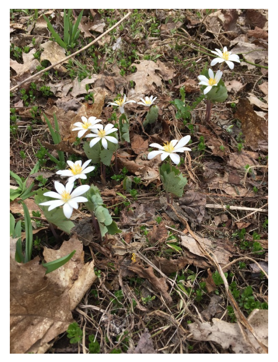
Bloodroot is one of the earliest spring wildflowers.

Does it seem like spring is coming earlier each year? It is, and the data support that observation: in our region of the mid-latitudes (the mid-mid-latitudes), for every ten degrees north from the equator, spring arrives about four days earlier than it did just ten years ago. In the southern U.S., spring arrives one day earlier, but if you were in the Arctic, you'd experience spring about 16 days earlier.